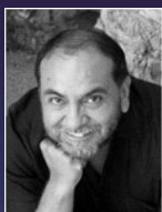
DON MIGUEL RUIZ