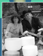
LIFE IN BALANCE